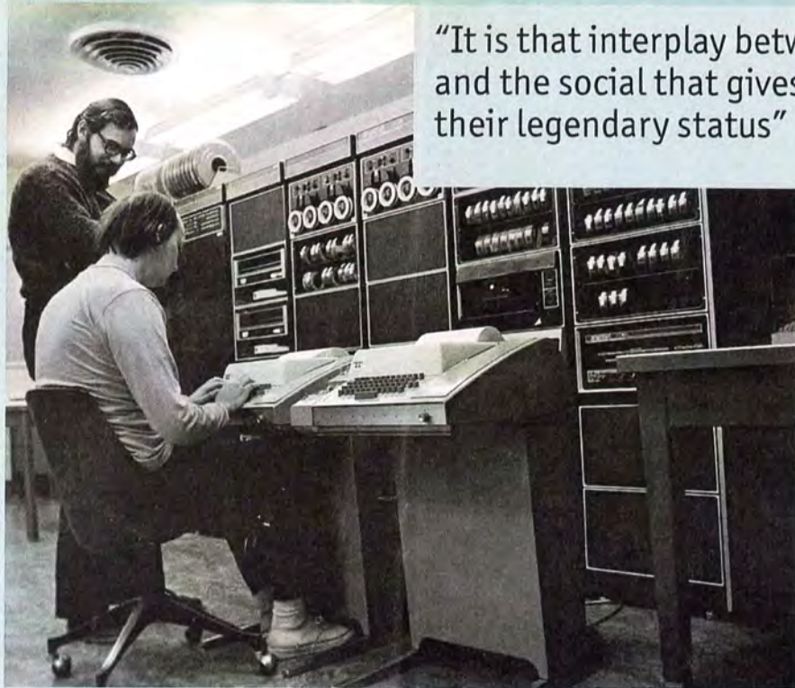
The good old days in the terminal room

"It is that interplay between the technical and the social that gives both C and Unix their legendary status"